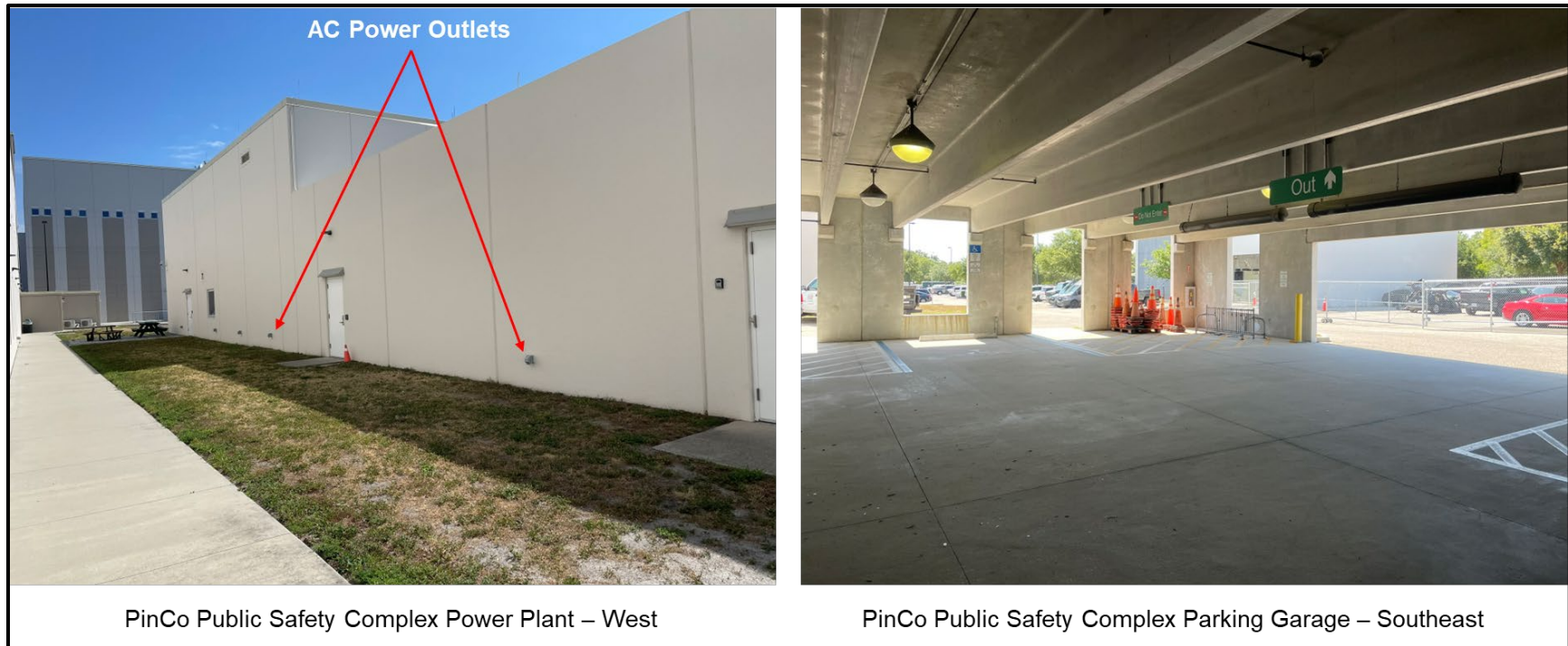
Figure C- 4. Command-Runner Operations Venue