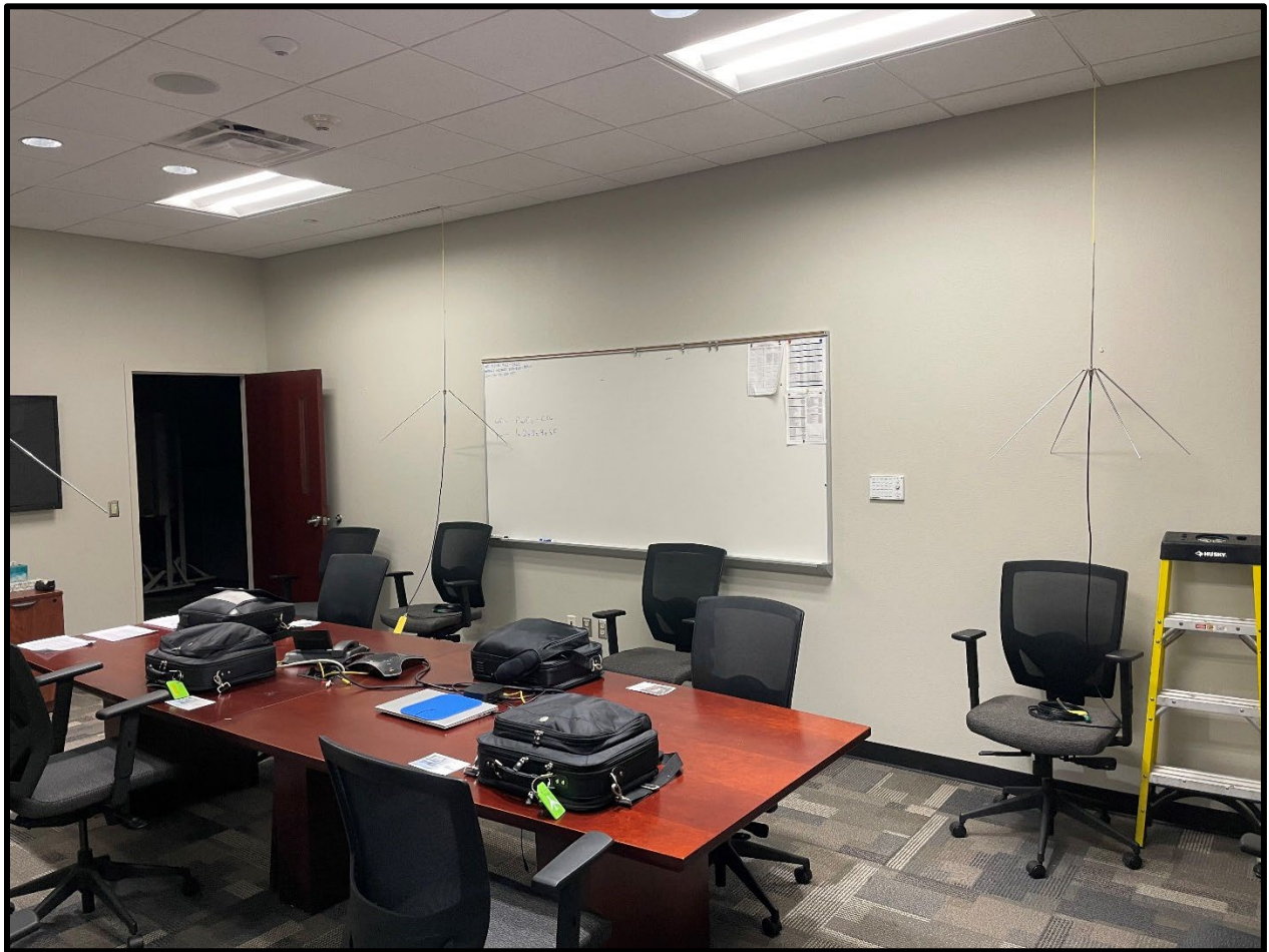
Figure C- 1. Shelter Team Venue

A training site survey was conducted on June 4 th , 2024. Venue locations were identified and are documented in the photographs below.