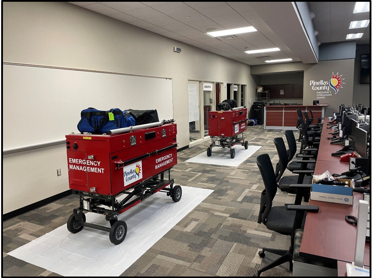
Figure C-2. Command-Runner - Prep for Deployment Venue